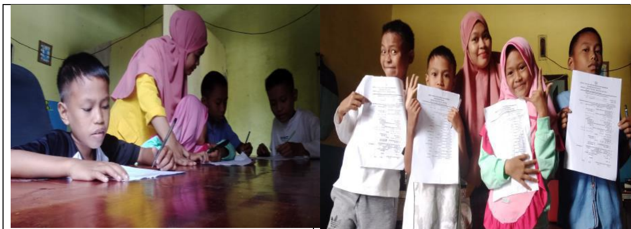
Figure 4 Student activities in the homeschooling system (2)

To see the achievement of the results of this activity, the younger students continued to accompany the children until the semester exams were completed. Because the implementation of this activity is close to the elementary semester exams, we also provide test simulations or tryouts for children to understand better the material and tests that the school will hold. The test results showed satisfactory results, and most children admitted that they understood their lesson better and hoped this activity would continue. They were enthusiastic and actively participated, including children and residents who helped run this activity.