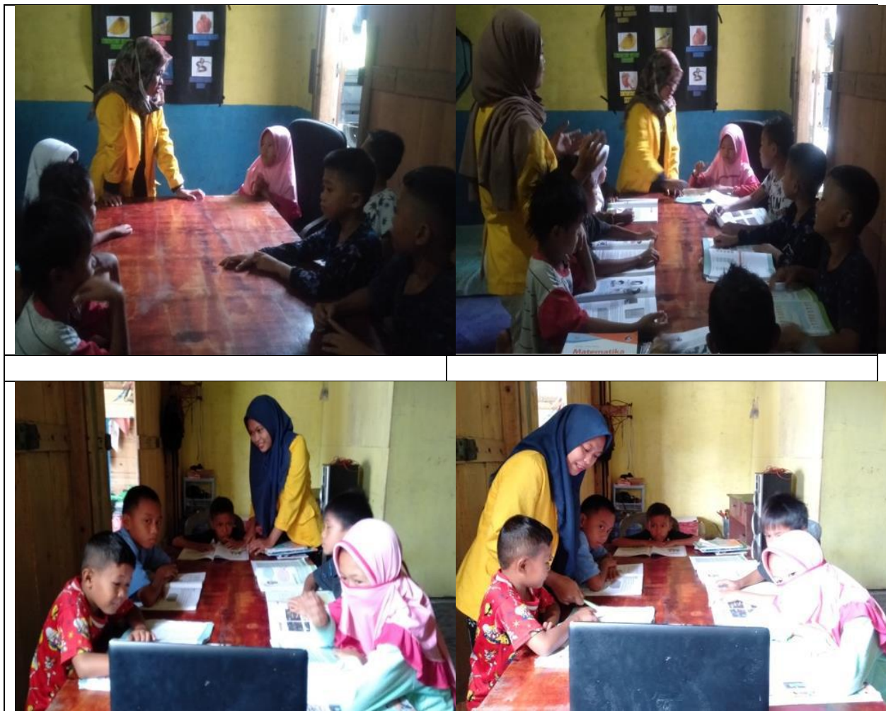
Figure 3 Student activities in the homeschooling system (1)

The picture above shows how the implementation of the activity takes place. Each study group consists of six to five children and three accompanying students. The action occurred in one of the residents' houses while observing the health protocol. The children seemed enthusiastic and eager to come and learn. They said that it had been a long time since they had studied with friends and that the group learning atmosphere with the help of their seniors made them happy and eager to learn. This is in line with findings that online learning has become difficult for students to follow. Ultimately, it gives rise to boredom, laziness, and even discouragement [25], [58]. One of the efforts to overcome this problem is to improve the quality of learning by changing the learning method to make it more interesting, fun, and well absorbed by students. This is what is applied in this activity. Furthermore, by combining games and learning, the children are increasingly enthusiastic about keeping coming to study every time the learning schedule takes place.