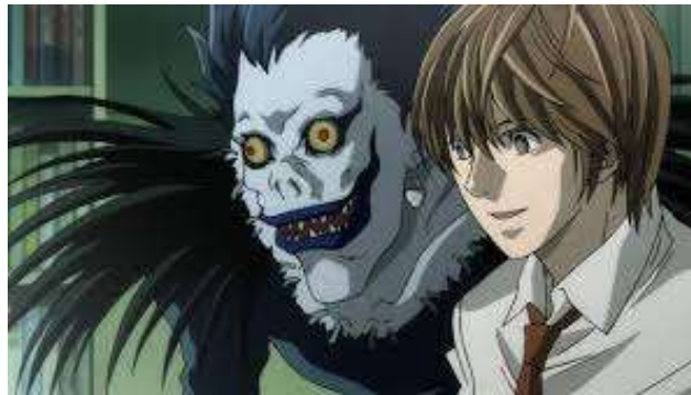
Picture 4. Image of the Death Note Shinigami, Ryuk

This research also opens up space for further studies on how the representation of power and morality in other fictional works can be analyzed using a semiotic approach. For example, the use of symbolism in Death Note can be compared with the symbolism in other fictional narratives exploring the concept of justice, such as 1984 by George Orwell or V for Vendetta by Alan Moore. Therefore, the semiotic approach used in this study can be extended to understand how popular media, as a whole, shapes societal understanding of authority, law, and morality. This research also contributes to the academic world regarding the role of popular media as a medium for social reflection[13]. The study shows that visual products like Death Note not only function as entertainment but also have the potential to articulate and negotiate ideological discourse in modern society. In Peirce's semiotic analysis, the signs in Death Note not only build an immersive fictional world but also become part of a broader social construction, where the audience can derive meaning and connect it to more tangible social and political contexts.