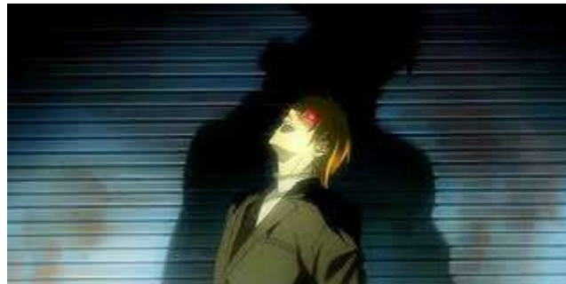
Picture 3. How the power of Death Note affects an individual.

social welfare. This phenomenon can be linked to how authoritarian figures in the real world often gain public support through narratives emphasizing their effectiveness in maintaining order, even through methods that violate law and ethics.