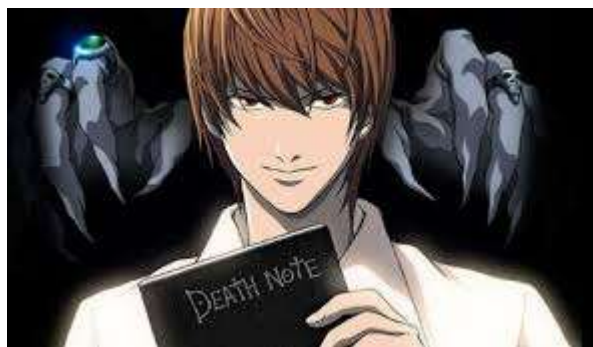
Picture 1. Light Yagami holds the Death Note.

The interpretant of this sign is that the book is not merely a tool for killing but also a metaphor for how power can alter an individual's perception of justice, ethics, and morality. The concept of power in Death Note can be analyzed through the perspective of panopticism as articulated by Michel Foucault. In Discipline and Punish (1977), Foucault explains that power is not only coercive but also operates through mechanisms of surveillance and the internalization of norms. Light Yagami, as the holder of the Death Note , acts as an unseen entity of surveillance, possessing absolute control over the world. By merely knowing someone's name and face, he is able to determine their life or death without the public knowing his identity. This represents how power functions in a hidden form, yet still disciplines society through fear and control.