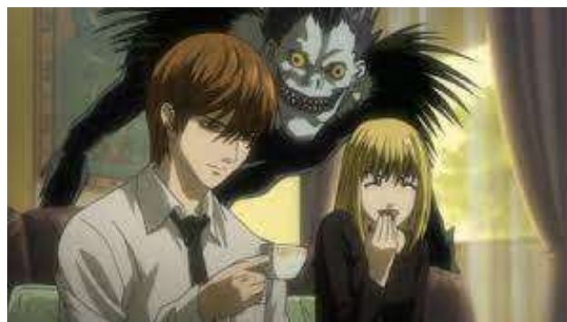
Picture 2. The Shinigami influences Light Yagami

The moral dilemma presented in Death Note is one of the key aspects that build its narrative complexity, particularly in relation to the ethical boundaries of power usage. This study analyzes how the signs in Death Note contribute to the construction of broader meanings about moral conflict, subjective justice, and legal legitimacy in modern society. By applying the triadic relationship between representamen, object, and interpretant, this research examines how the symbolism in Death Note shapes the discourse on moral authority and how absolute power, without control, can lead to destructive moral deviation.